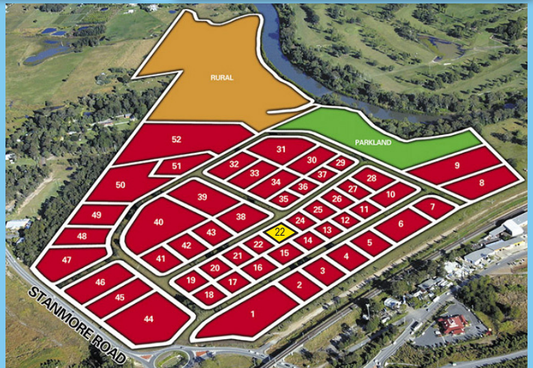
SITE PLAN SCALE 1 : 200